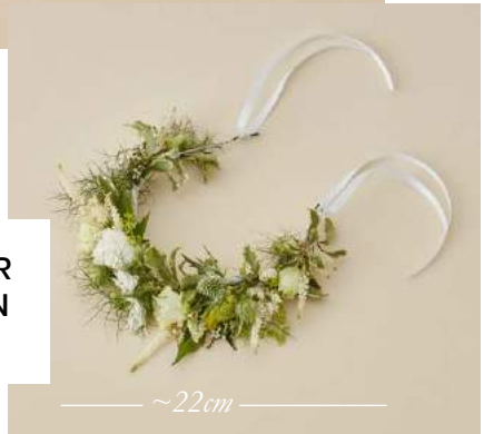
FLOWER CROWN £30