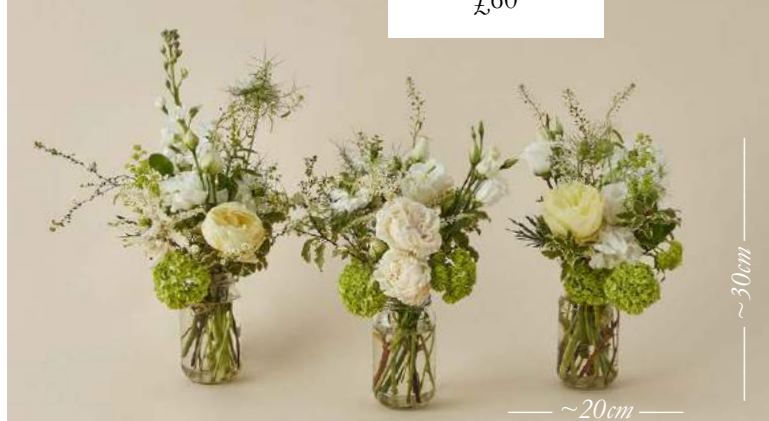
JAM JARS £60