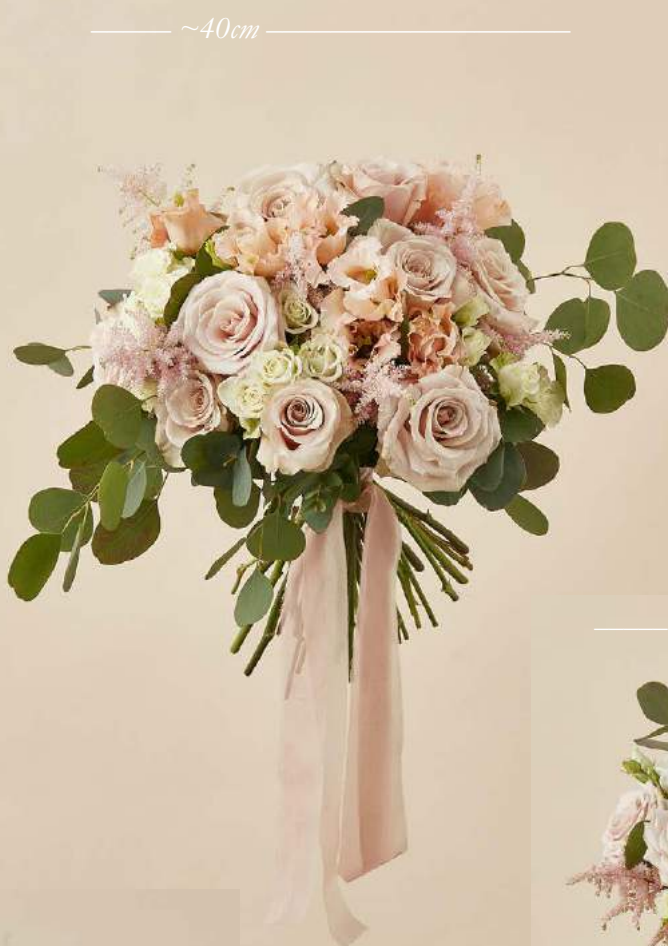
BRIDAL BOUQUET £145

Blush pink and nude roses plus apricot lisianthus, spray roses, astilbe and eucalyptus.