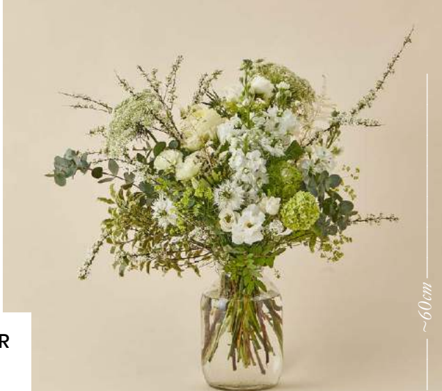
PICKLE JAR £85

White roses plus seasonal beauties like llisianthus, spray roses, astilbe and a mix of foliage.