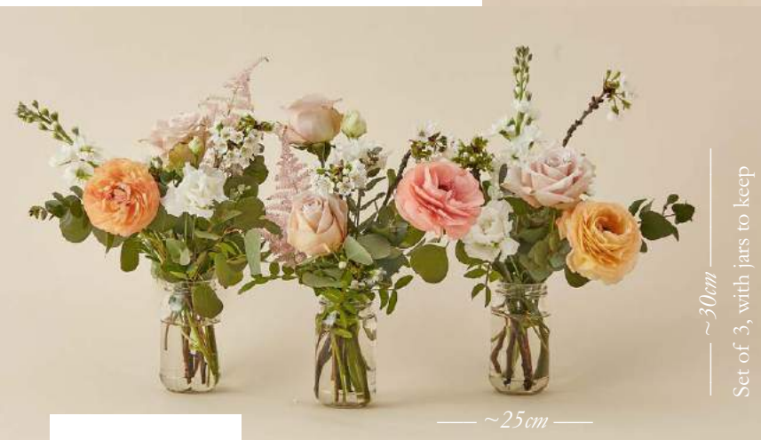
JAM JARS £60